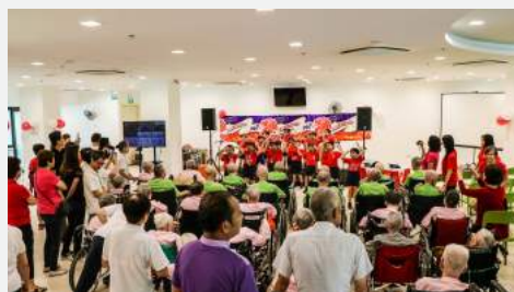
Grace Lodge Nursing Home Intergenerational bonding: school children performing for residents!