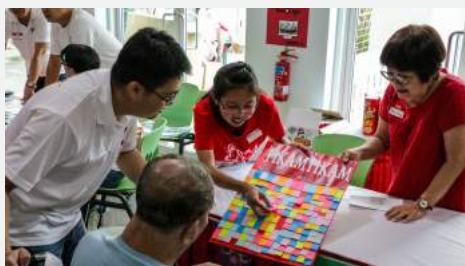
Peacehaven Nursing Home Who's feeling lucky at Tikam Tikam?