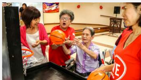
All Saints Home (Hougang) Shooting hoops at Mini Basketball!