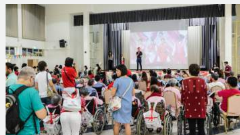
Society for Aged Sick Volunteers and residents watching NDP on the big screen!