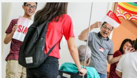
Ren Ci Hospital Enthusiastic volunteers giving a rousing welcome to residents!