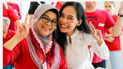
Peacehaven Nursing Home Wonderful volunteers posing for a photo!